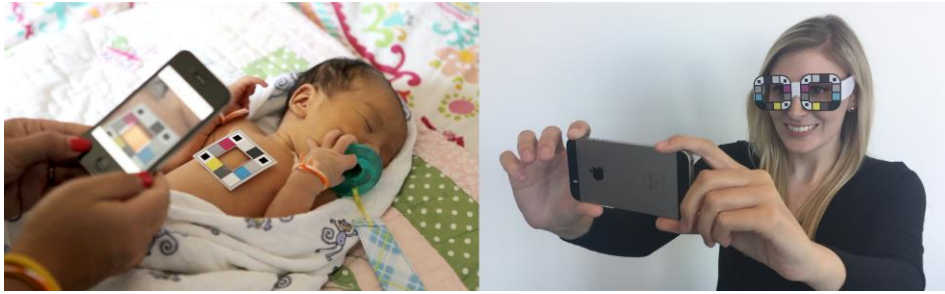
Figure 2. To account for different lighting conditions and camera sensors, both (left) BiliCam and (right) BiliScreen incorporate paper accessories with colored squares that can be used as calibration references.

when developers have access to raw sensor data. For example, the IR time-of-flight sensor can be used as a pulse sensor if an API exposes raw sensor values, avoiding the need for custom kernel solutions that cannot be widely deployed.